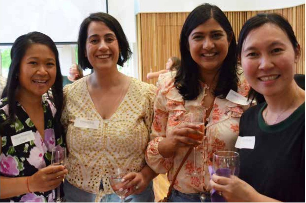
Caption The Class of 2003 reminiscing together at their 20 year reunion