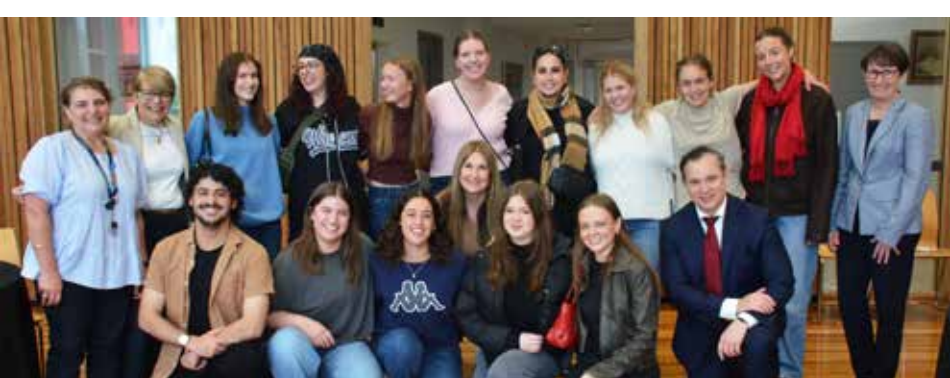
Caption: Some of our 2023 VCE students joined us for morning tea on results day