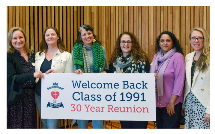
Class of 1991 – 30 Year Reunion