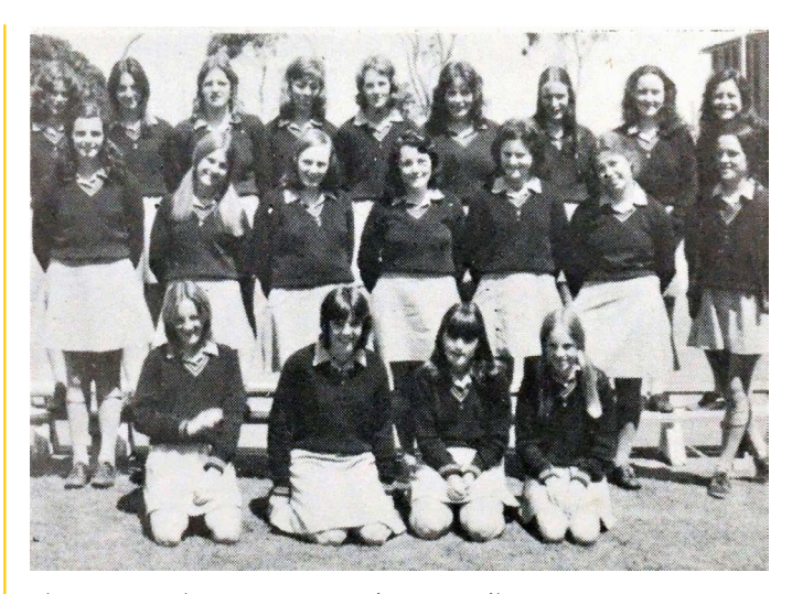
The 1975 Student Representative Council

We take great inspiration from these leaders who chose to serve and leave a legacy for future generations.