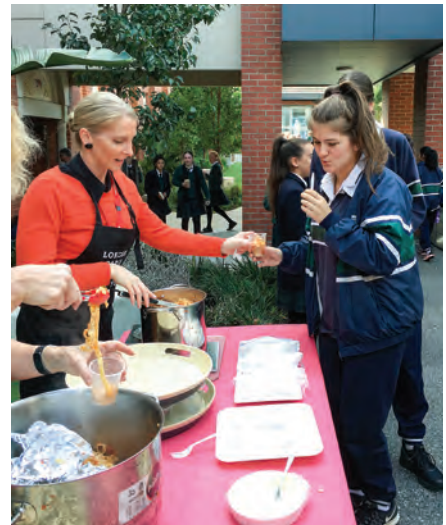
Four Nonna's pasta offer sampling

The P&F has also been busy on the fundraising front with a Hot Cross Bun Drive and a Mother's Day offer