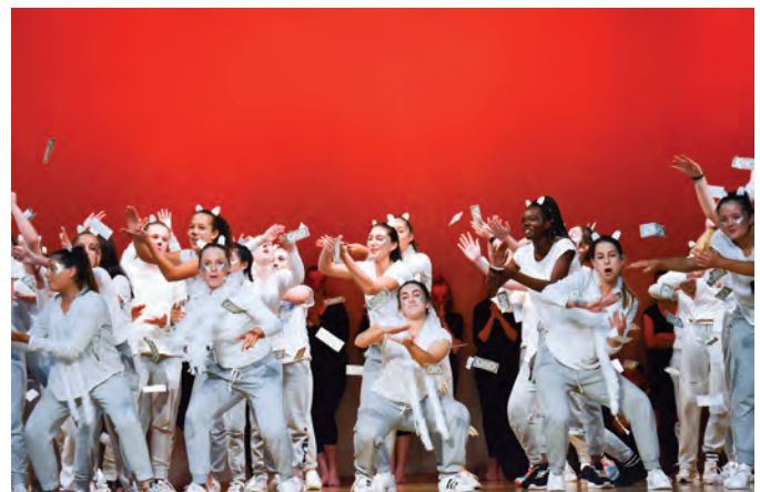
Hartzler House was declared the 2017 Performing Arts Spectacular winner