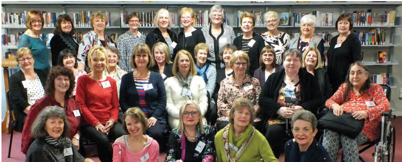
Class of 1967, 50 year reunion