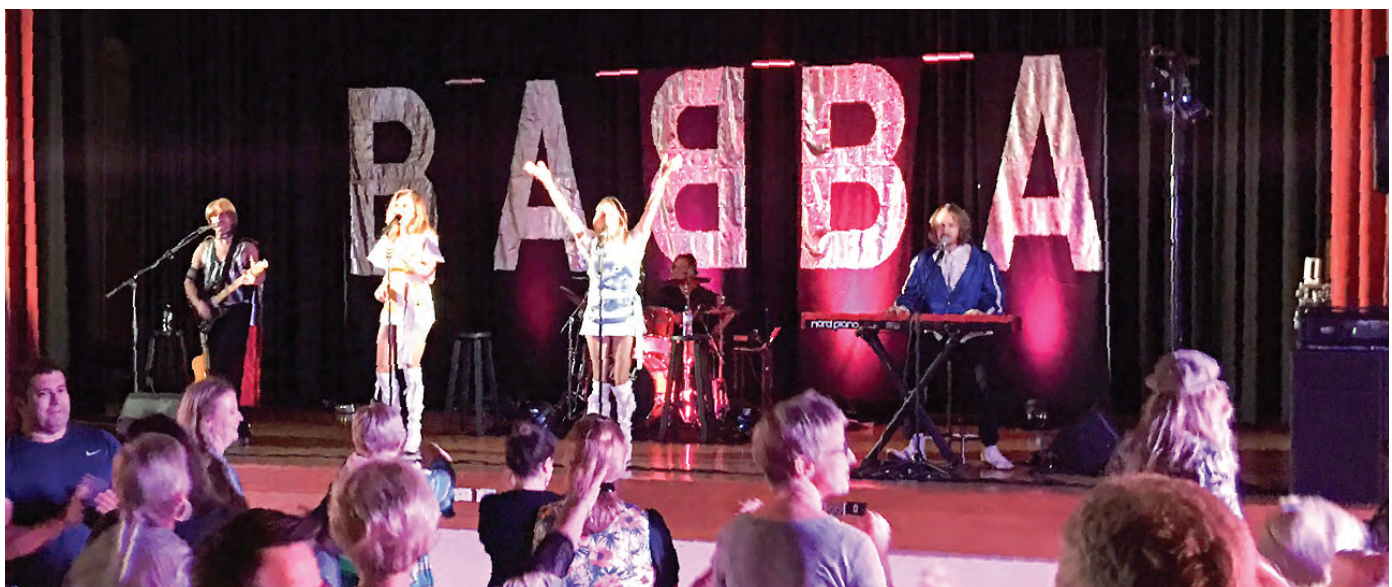
BABBA parent evening

Sincere thanks also go to the busy parents who are members of the OLSH College Parents and Friends Association, the time and effort they devote to helping the College is very much appreciated.