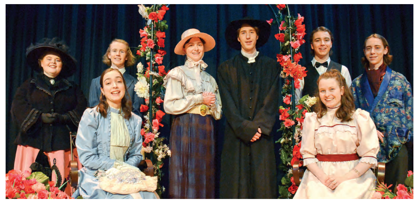
The Importance of Being Earnest

teachers have pushed me to do, or put together for me, has made me the person I am today."