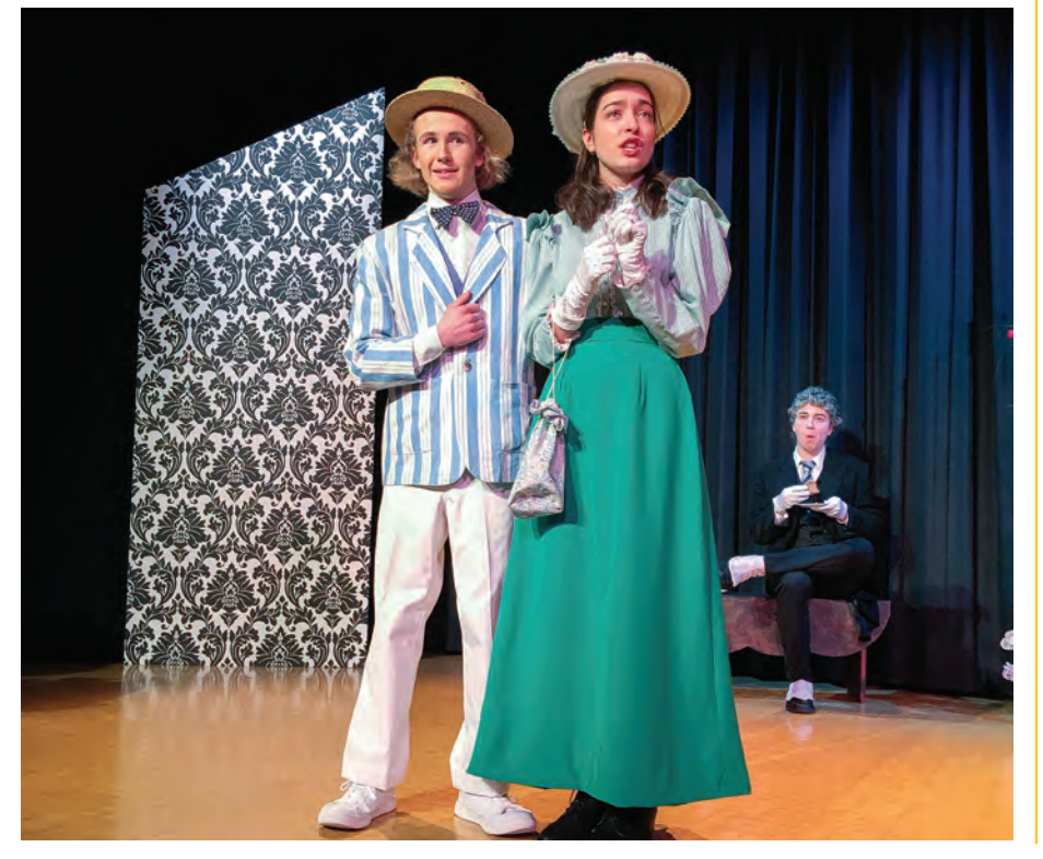
The Importance of Being Earnest

students performing, playing, singing and dancing in a variety of acts. It is a wonderful evening of entertainment and is a showcase for the high standard of performers from the College.