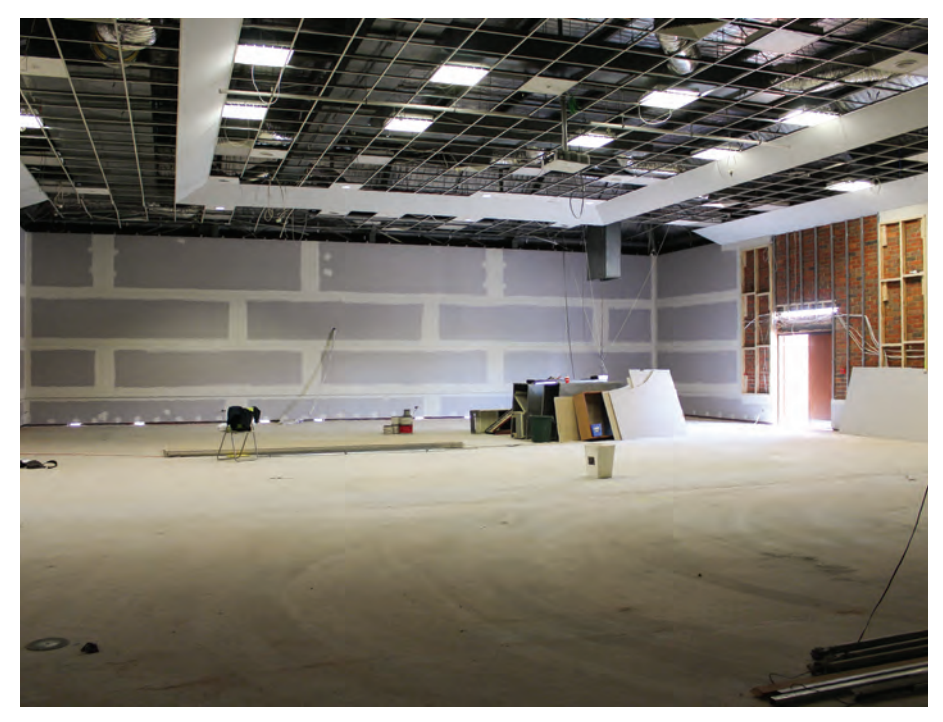
Performing Arts Precinct

The redeveloped Performing Arts Precinct will provide a new facility to showcase the many recitals, shows and performances that we are fortunate to see at OLSH College.