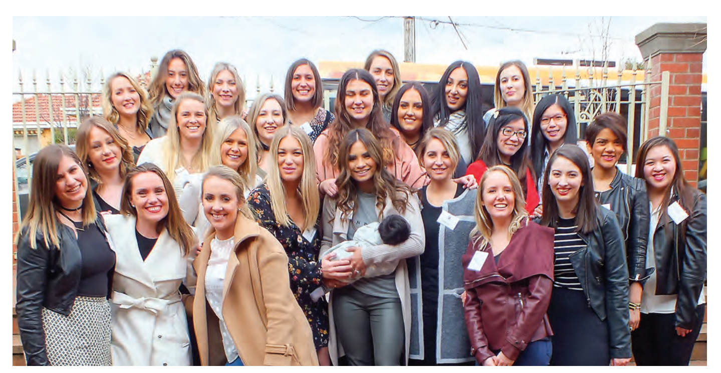
Class of 2006, 10 year reunion