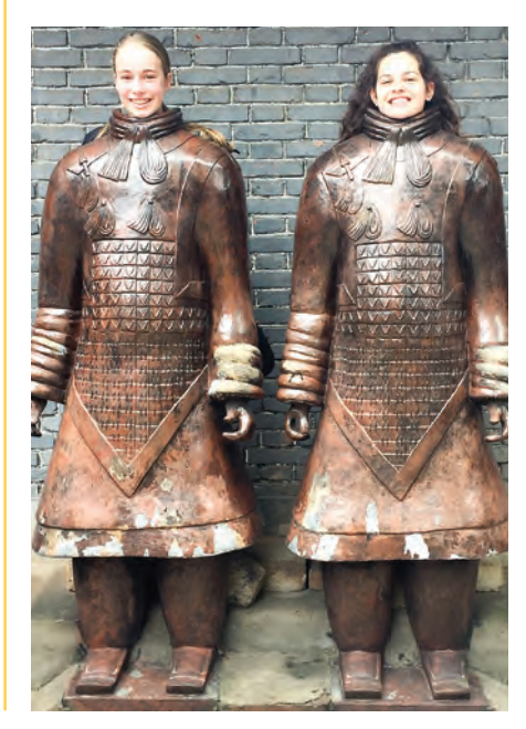
Terracotta Warriors in China

In 2015, the first OLSHIES trip was offered as an alternative to attending SCHOOLIES. Students who had finished Year 12 travelled to the Philippines where the OLSH Sisters do inspirational work. The girls assisted with the tutorial program and helped to feed undernourished children. It was at times confronting as they visited the poorer areas