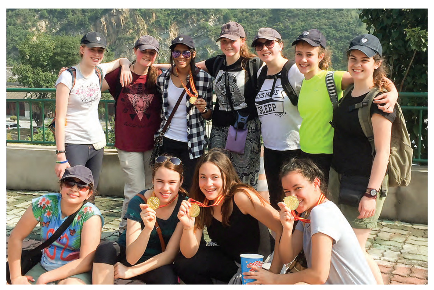
At the Great Wall of China

of the Philippines; however they learned valuable life lessons and met many extraordinary people. The inaugural OLSHIES trip was such a success that it will take place again this year.